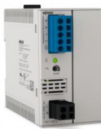
Power Supply 100-240VAC/48VDC 2A