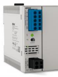
Power Supply 100-240VAC/24VDC 4A