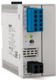
Power supply 100-240VAC/24VDC 2A