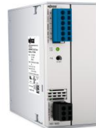
Power supply 100-240VAC/48VDC 5A