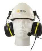
AK5850BS Ex TwinCom Helmet Headset w/ear plug connector

Ex-approved Headset with helmet mounting and connector for ear plug